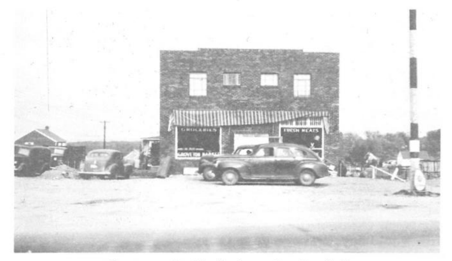
Chauncey's Market on Route # 1

We've got a problem, too. If they ever decide to put in a service road we would have to tear this building down. There is no way we could do anything. . . We hope they don't do it, but, I'm sure, knowing the county and the state, it won't be long before they'll decide to. . . Somebody like us has to do some building, then we gotta donate the (service) road and put it in for them. But if they decide they're gonna do it, then they have to condemn the property that's left and pay for it. If we can sit here and do nothing until they decide to put it in, then they. . . pay for the condemnation of the property. So, ah, it's a matter of when they get around to doing that.