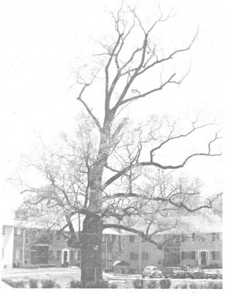
The tree at Mt. Vermon Square reputedly mentioned in George Washington's journal