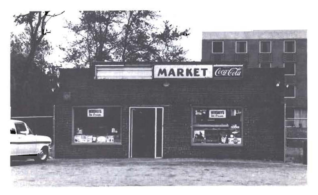
Formerly Pat's Market

I'm saying there have always been family problems and there always will be family problems because these are problems of growing up and living together. Families are more mobile than they ever have been. We are mobile around here because of the high percentage of military and government workers. It used to be when a family grew up, a grandfather and grandmother on both sides were in the same town, or the son grew up on a piece of land and he stayed right next to dad and got a family and raised it. There are still communities in this country where people live and die in the same community, but that's not true in this area. I'm sure you have a hard time finding people that spend all their life here.