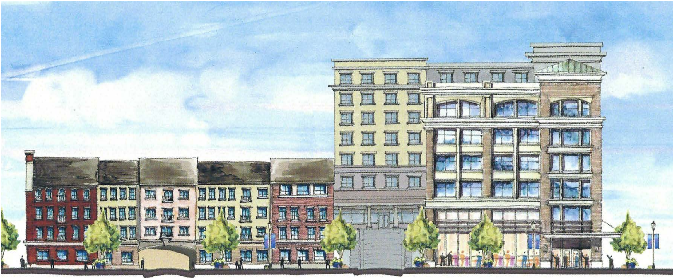
Groveton Street Elevation (2008 Concept)