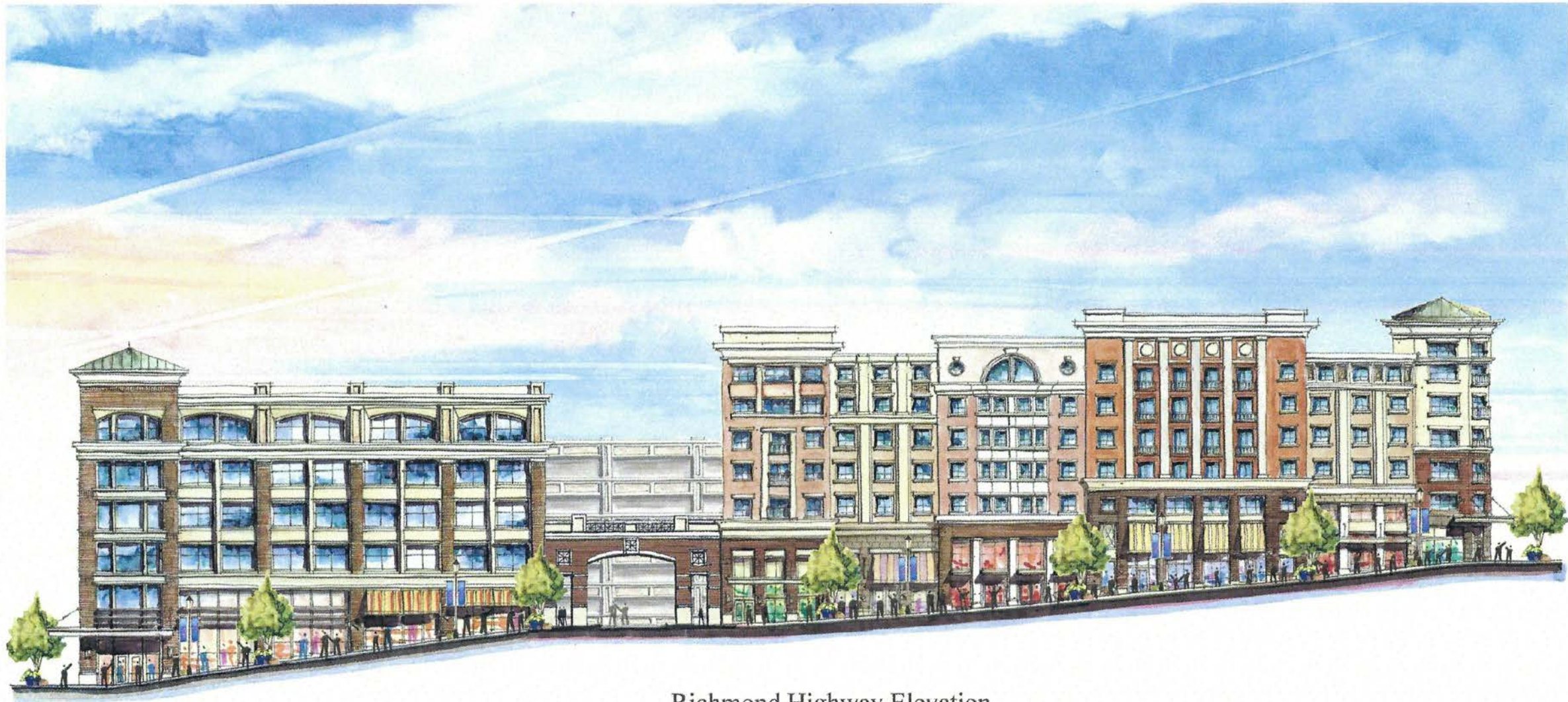
Richmond Highway Elevation (2008 Concept)